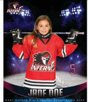
8X10 PORTRAIT $ 16.00 EA