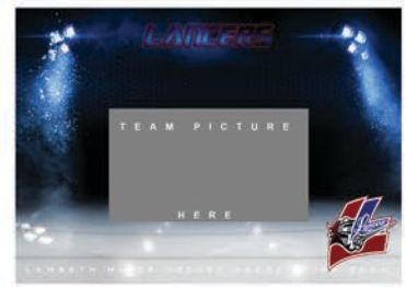
EXTRA TEAM PICTURE 5X7 $ 8.00 EA