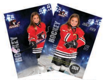
TRADING CARDS $ 25.00 8/ SET (STADIUM BACK GROUND ONLY)