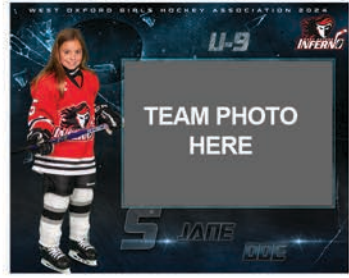
8X10 PLAYER/ TEAM COLLAGE $ 16.00 EA