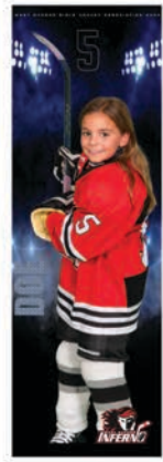
10X30 LOCKER / DOOR POSTER $ 35.00 EA