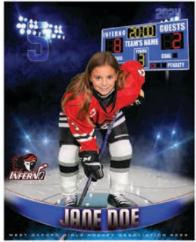
16 X 20 POSTER $ 35.00 EA