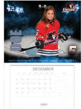
13 MONTH CALENDAR $ 25.00.00 EA