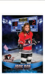
5X7 PORTRAIT $ 11.00 EA