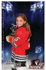
FRIDGE/ LOCKER MAGNETS $ 25.00 4/ SET (STADIUM BACK GROUND ONLY)