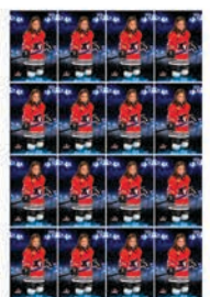
16 WALLETS $ 16.00 / SET