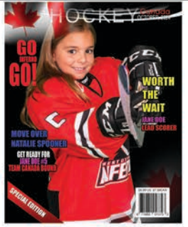
8X10 MAGAZINE $ 16.00 EA (BLACK BACKGROUND ONLY)