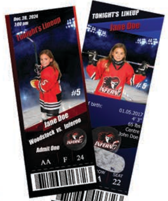
ARENA TICKETS $ 25.00 4/ SET (STADIUM BACKGROUND ONLY)